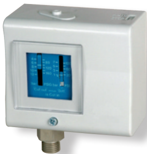
Control pressure switch PS 1-...

Compact size pressure switch for high and low pressure, such as vacuum applications